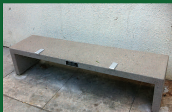
Type 2: Concrete Bench $1,000