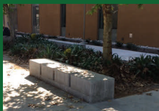
Type 3: Designated Sitting Area $500